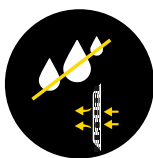
WATER RESISTANT & BREATHABLE