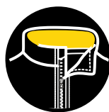
STAND UP COLLAR